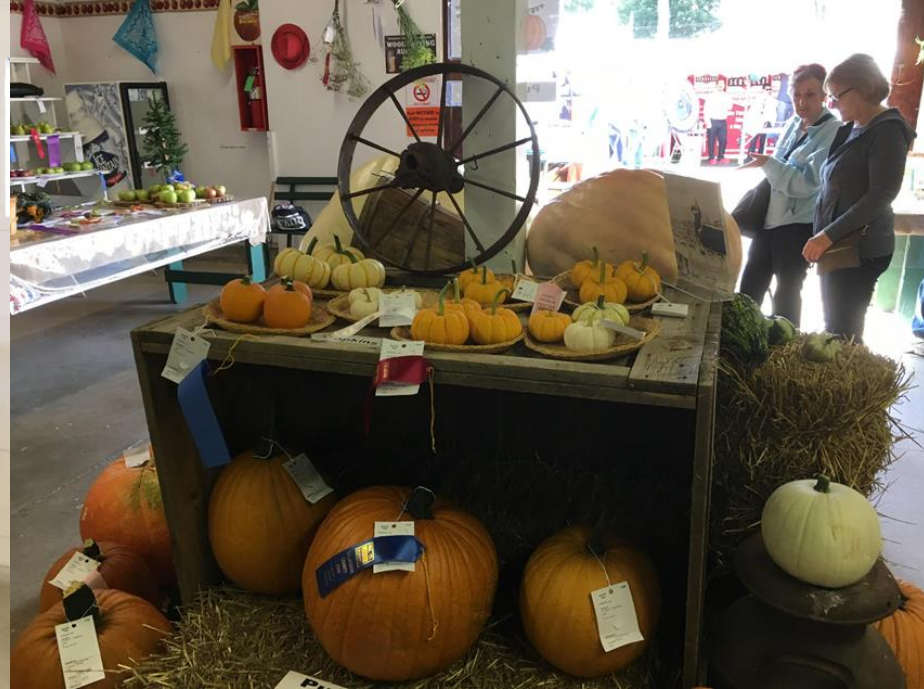
Walworth County Fair -Elkhorn, Wisconsin