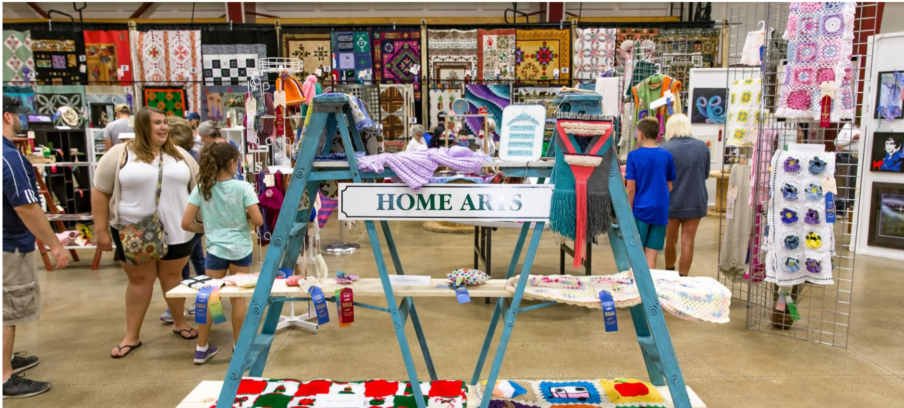
Douglas County Fair and Rodeo